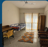
SINGLE AC ROOM RS. 80,000/-