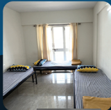
TRIPLE SHARING ROOMS RS. 27,000/-