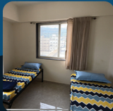
DOUBLE SHARING ROOMS RS. 40,000/-