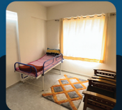
1 BHK WITH AC BEDROOM RS. 1,50,000/-