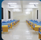
GENERAL WARD RS. 33,000/-