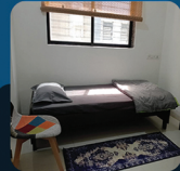
SINGLE DELUXE AC ROOM RS. 99,000/-