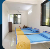
THREE BEDDED AC ROOM RS. 55,000/-